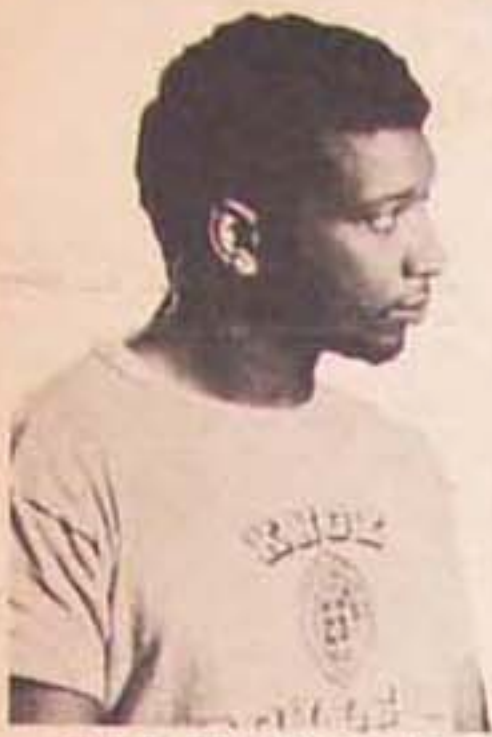
FRED HAMPTON, MURDERED BY PIGS