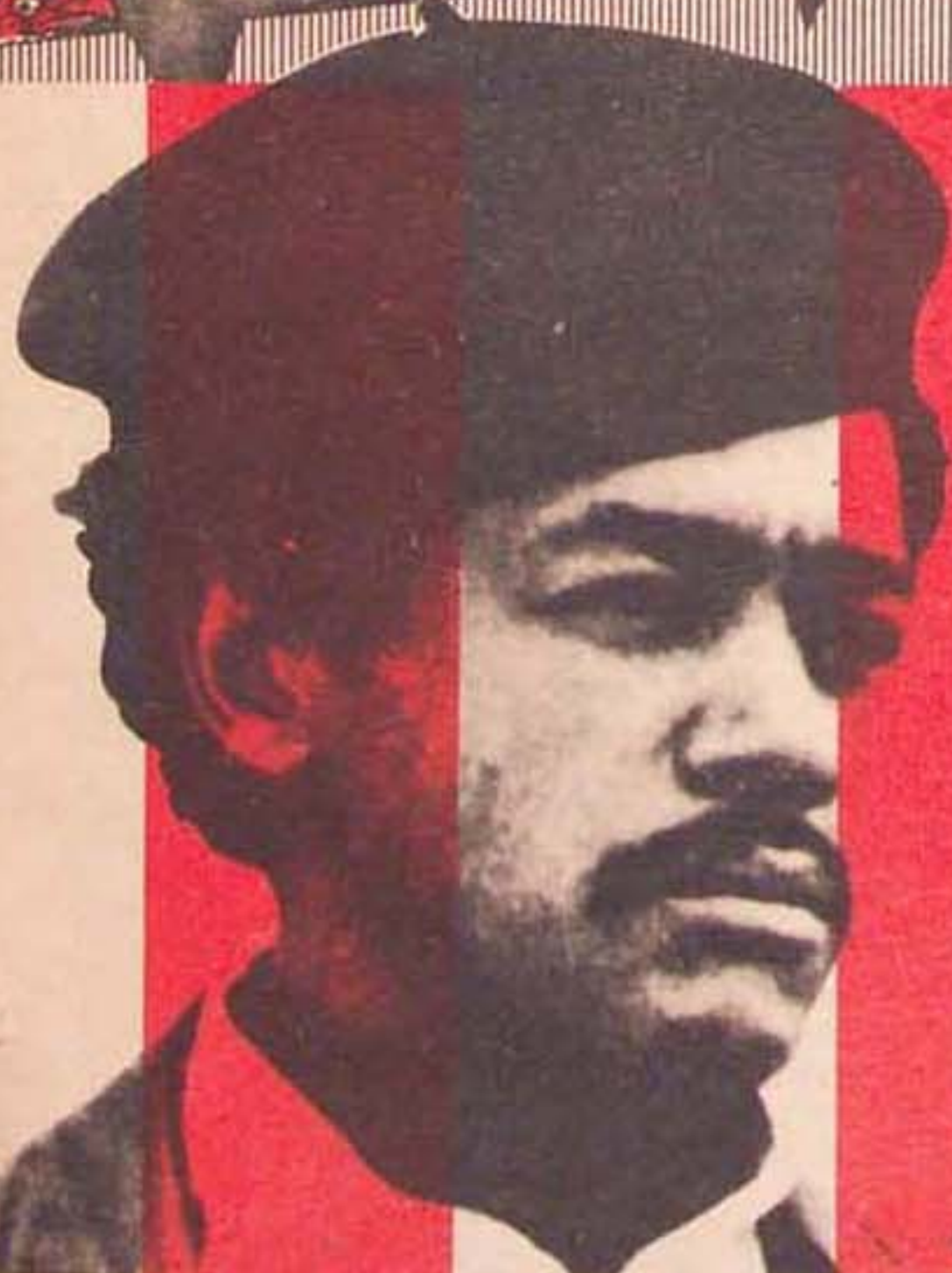
BOBBY SEALE, CHAIRMAN, B.P.P. POLITICAL PRISONER