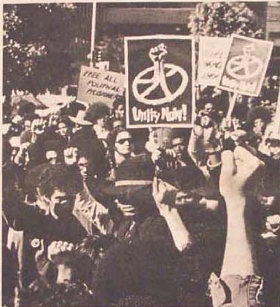
L. A. RALLY, JANUARY 6, 1969