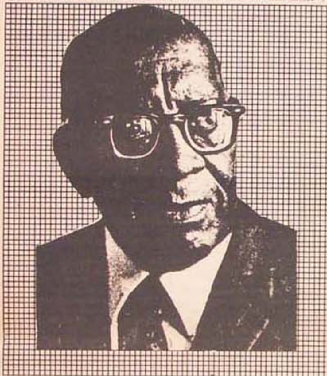
William L. Patterson

A new decade confronts us. It calls for unity - unity in struggle - of Black, Brown, Yellow and White against racism. That unity can profoundly influence the decade ahead. It can be of decisive political significance for the people. That unity is possible if its limitless potentialities are recognized by the masses in the labor movement. For Black leaders who are also citizens of the U.S.A., human beings and now part of a world movement for the liberation of all mankind from oppression, the fight for unity is a fight for allies without whose aid victory stands in the greatest danger.