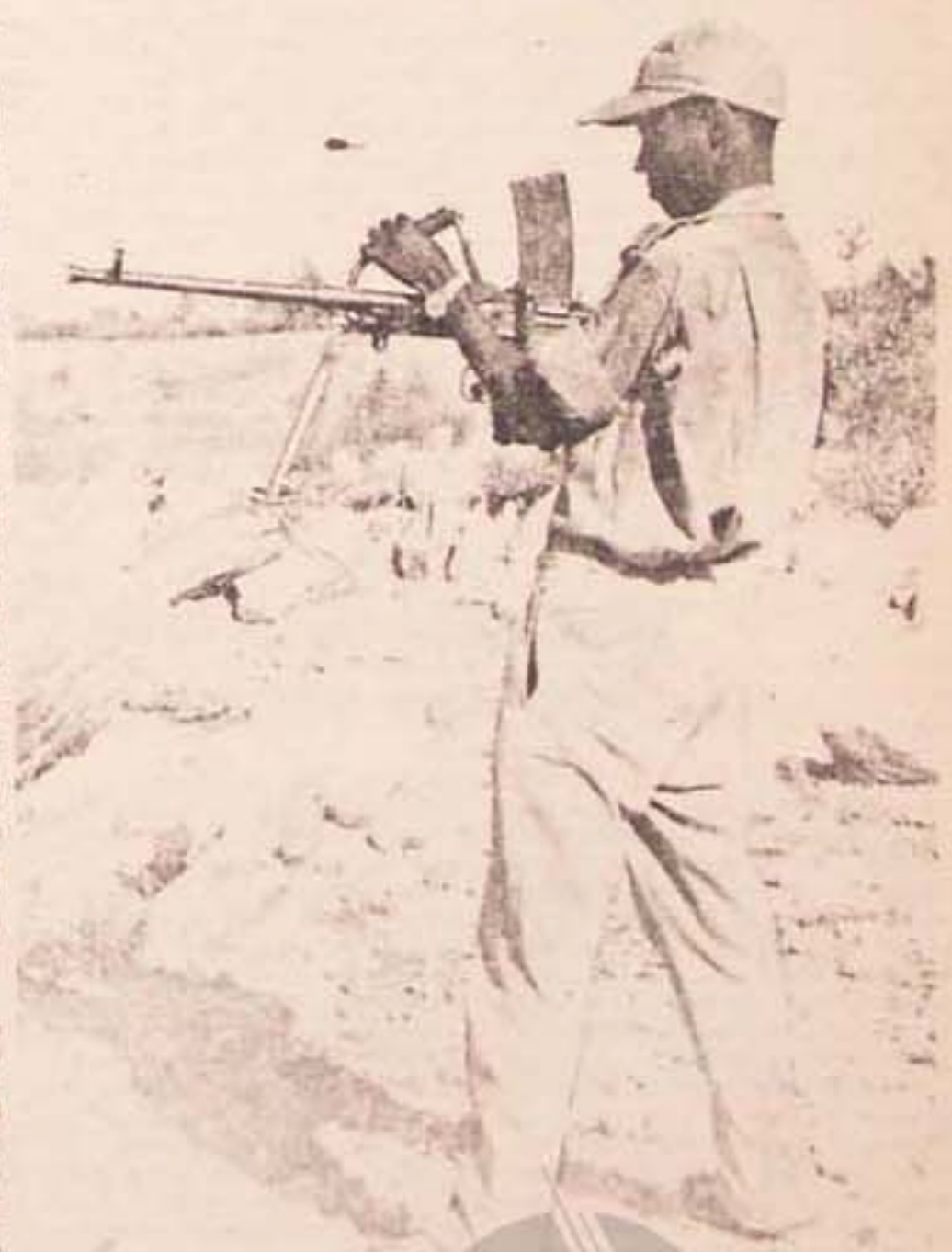
ERITREAN LIBERATION FIGHTER

American imperialism is doomed to failure and the blows struck by the Eritreans are just the beginning of the final world wide defeat of American imperialism and all of its lackeys. But there must be blows, shots, killings, and explosions, all are necessary if U.S. imperialism is to be removed from the world and oppression is to be brought to a complete halt. Comrade Kim Il Sung pointed out the necessity of oppressed people fighting against the imperialistic forces when he said "the imperialists headed by U.S. imperialists will never quit the arena of history of their own accord. Dismantling of its old position, imperialism is making desperate efforts to recover its lost footholds and is trying to find a way out in aggression and war to save itself from the doom." People