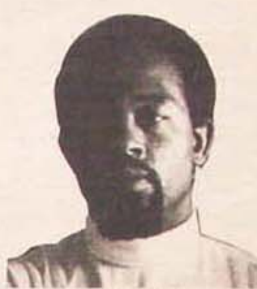
ELDRIDGE CLEAVER, MINISTER OF INFORMATION B.P.P.

"On the question of socialism," said the exiled Minister of Information, "The Black Panther Party does not and has never said that if socialism is instituted that racism automatically ceases (although some critics of The Black Panther Party have implied, namely Stokely Carmichael, that we