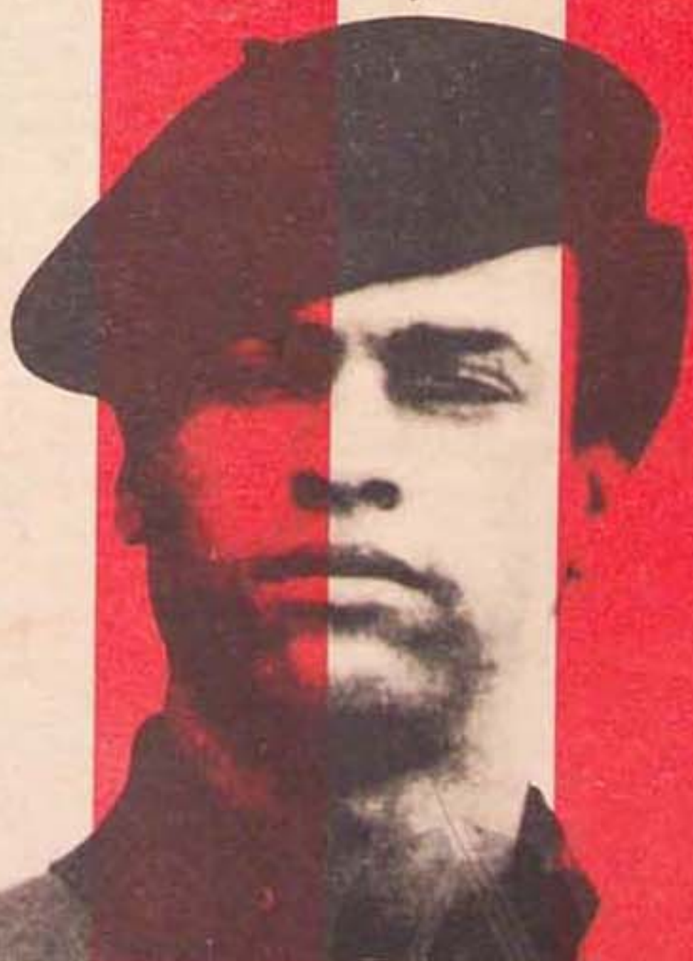
HUEY NEWTON, MINISTER OF DEFENSE, B.P.P. POLITICAL PRISONER